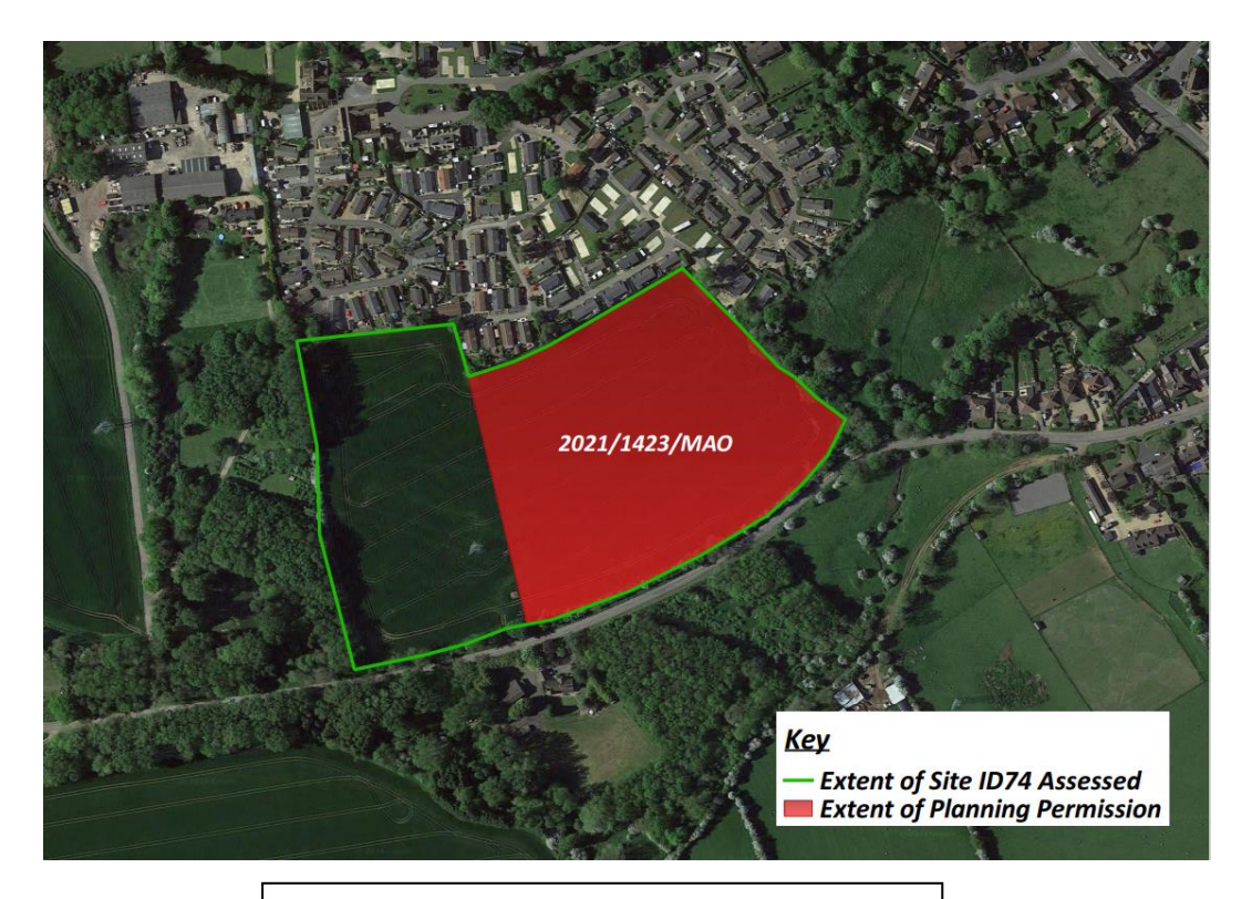
Figure 1 – Extent of Planning Permission for Site ID74

There is therefore a significant parcel of land in a key and sustainable location that has been assessed incorrectly. Not only does this mean that Site ID74 has unfairly not progressed further than a Stage 1 assessment, but that the site assessment process for this Pre-Submission Draft Plan is flawed , affecting the soundness of the plan.