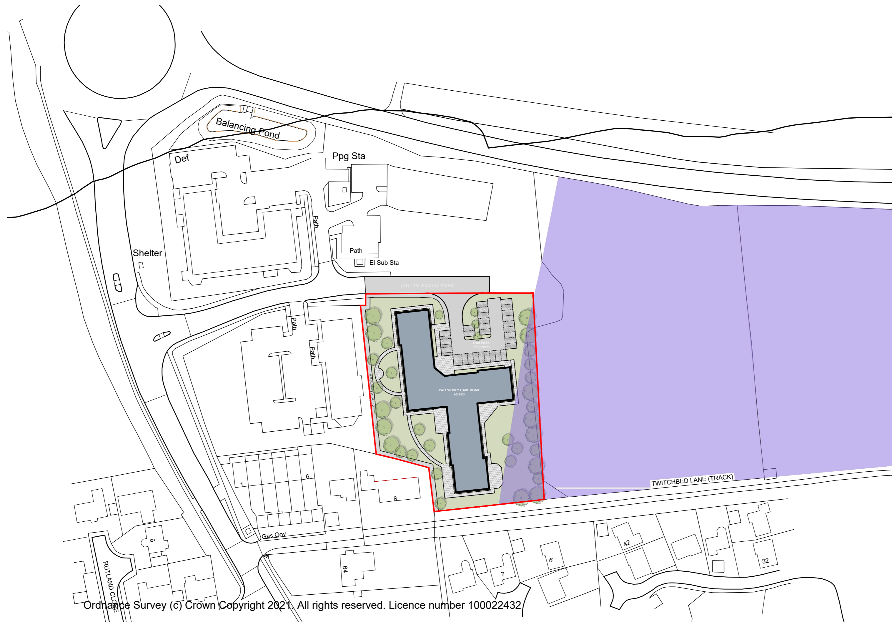
1 CONTEXT PLAN 1:1000